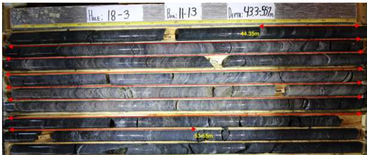
Image Description: Image of core run for hole 18-03 showing intersection of North Zone between 44.35 and 53.55 meters down the hole. See description above. Photo taken on site at Lingman Lake mine, September 8 th , 2018. The drill hole pierced the North Zone about 10 to 16 meters below the 150 Level drift (46-meter depth, east-west underground tunnel) of the mine. The intercept is below a 41-meter length of this drift, which historical records indicate averaged 15.4 grams of gold per tonne.